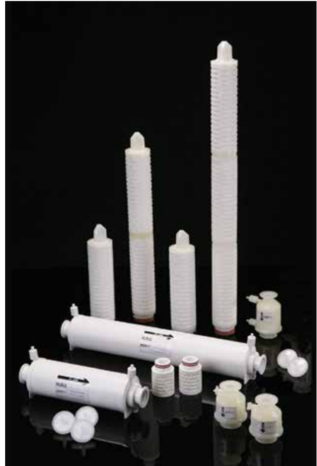
Note: PROCLEAR and DEMICAP are registered trademarks of Parker Hannifin Corporation.