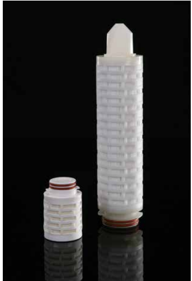
Note: PREPOR is a registered trademark of Parker Hannifin Corporation.