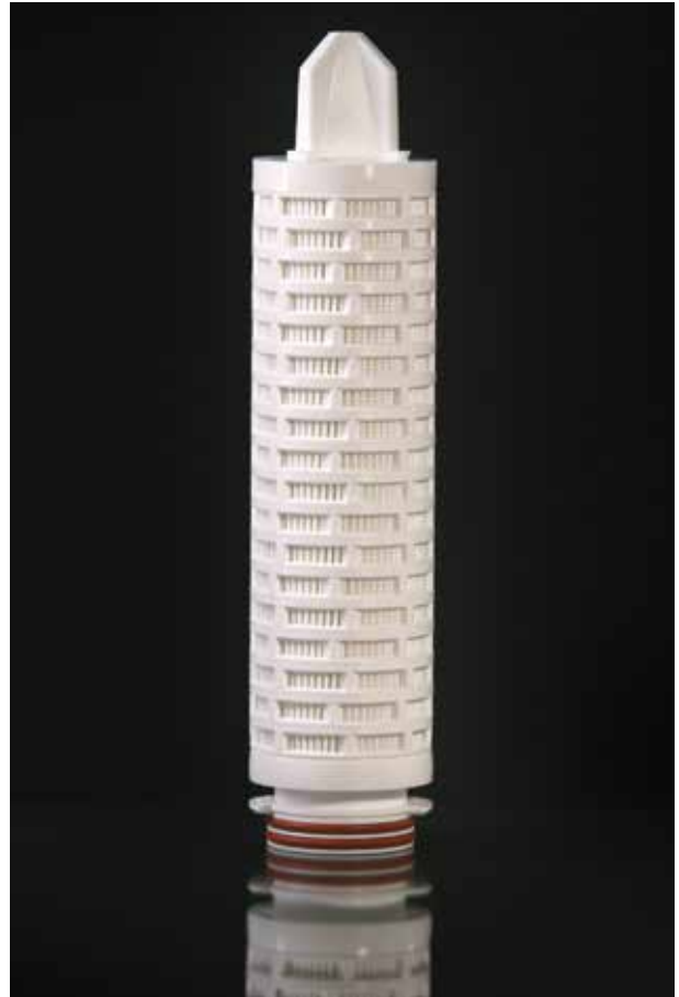
Note: PREPOR is a registered trademark of Parker Hannifin Corporation.